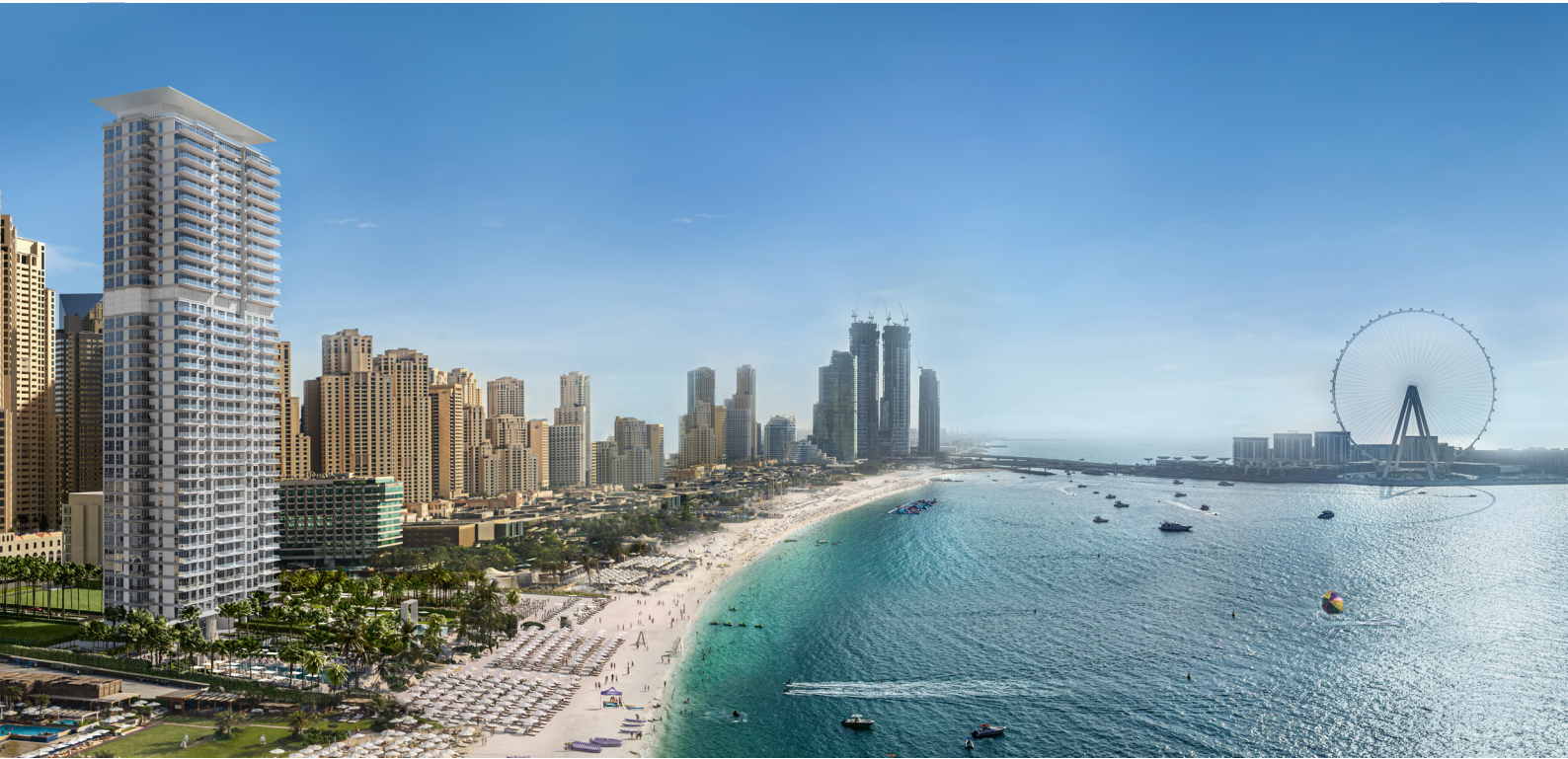
○ La View Tower