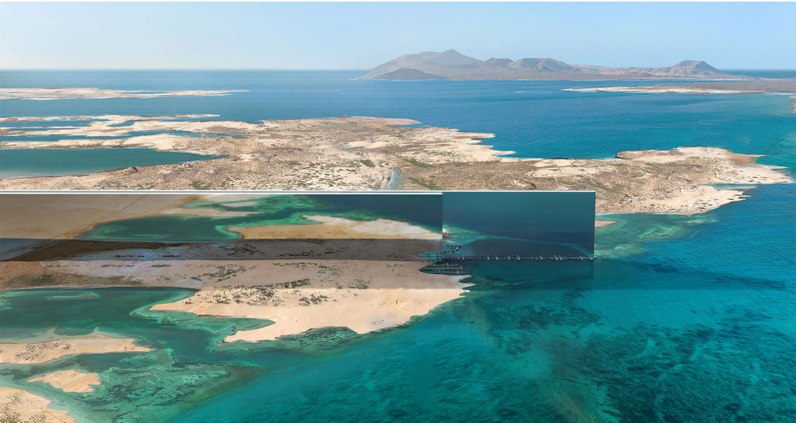
○ THE LINE, Phase I